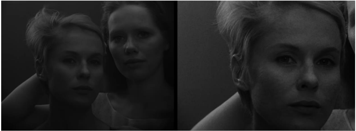
Figure 2: Close face shots